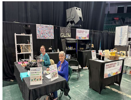
Hands-on with Miami Mineralogical and Lapidary Guild Come learn about the lapidary arts. Watch experienced Lapidarists demo on the art of beading, wire wrapping and shaping stones. Experience the art of rock painting or making a beaded bracelet.