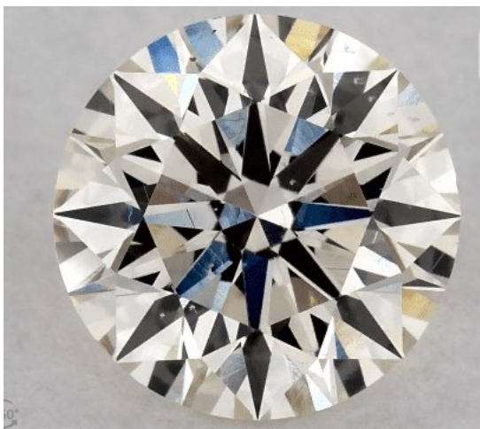
This 1.00 ct. diamond has a slightly warm color with a grade of L