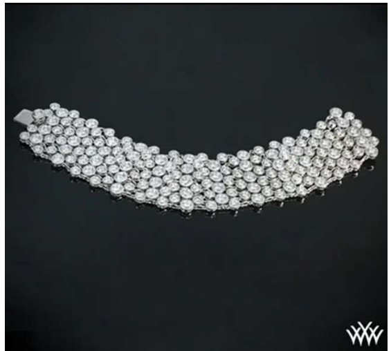
This wide 18K white gold bracelet features a 9-row fluid sea of diamonds. While they are technically colorless, many sellers will commonly advertise them as white diamonds.

The vast majority of natural diamonds - somewhere near 98% of the total global product - are colorless. Colorless diamonds may express small amounts of yellow, brown, or gray. If all other factors are the same, colorless diamonds with lesser amounts of these colors are rarer, thus more valuable, than those with more.