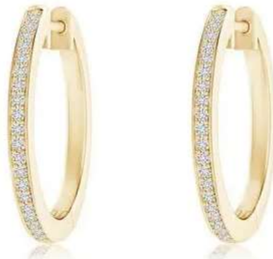
The 14K yellow gold mounting of these hoop earrings has a nice contrast with the colorless diamonds, but it also makes them appear to have a warmer color.

From a physical wellness standpoint, diamonds are often associated with brain health as well as a good sense of balance and having lots of energy. Diamonds have a very good thermal conductivity that makes them feel cool to the touch. Perhaps this enduring coolness inspired the belief that they also promote mental clarity. Additionally, it was thought that the gem could pull toxins out of the body if held close.