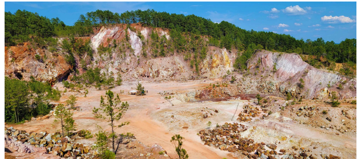
Graves Mountain Main Pit