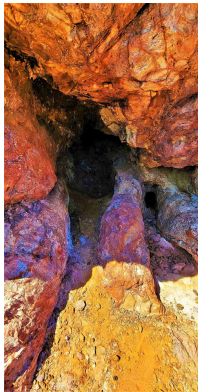
Graves Mountain Rutile Tunnel