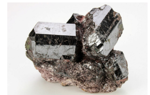
Graves Mountain Rutile Clusters