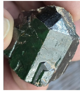
Graves Mountain Rutile Crystal