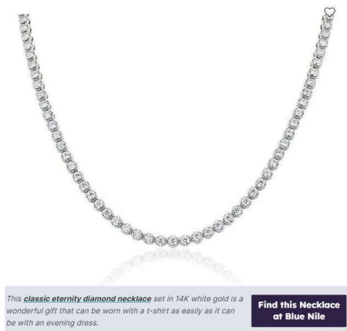
This classic eternity diamond necklace set in 14K white gold is a wonderful gift that can be worn with a t-shirt as easily as it can be with an evening dress.

The vast majority of natural diamonds - somewhere near 98% of the total global product - are colorless. Colorless diamonds may express small amounts of yellow, brown, or gray. If all other factors are, the same, colorless diamonds with lesser amounts of these colors are rarer, thus more valuable, than those with more.