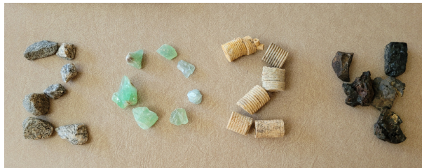
Last years winning entry

The SFMS Youth Resources Committee is excited to announce a new annual contest! SFMS club juniors are encouraged to submit a photo of rocks, minerals, gems, lapidary, and fossil items in the form of the year “2025” to be used on the officer’s contact lists page of the SFMS website. The deadline for entries is August 16, 2024 . Please click the following link for rules and details: https://www.southeastfed.org/contests-awards/juniors-year-in-rocks-contest