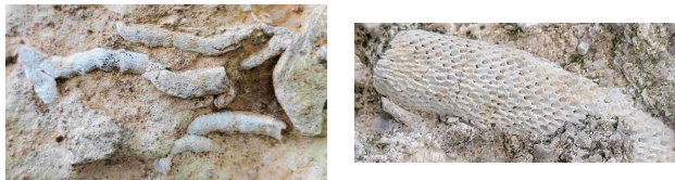
Branching Bryozoan