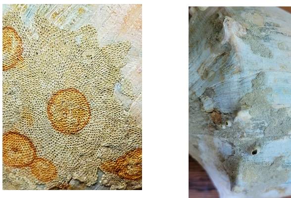
Modern Whelk w/Encrusting Bryozoan