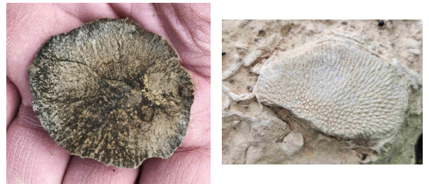
Domed Shaped Bryozoan