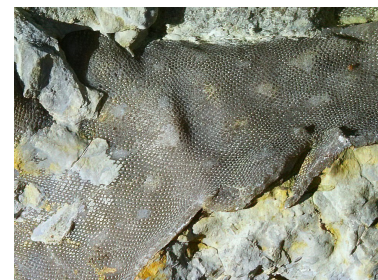
Ribbon Shaped Bryozoan