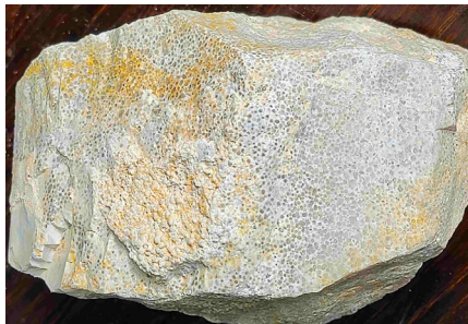
Summerville, GA Oolite