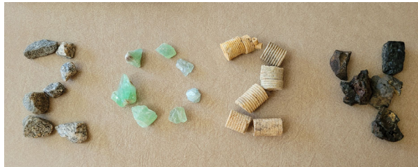
Last years winning entry

Copy of the rules are on page 18 of the Lodestar.